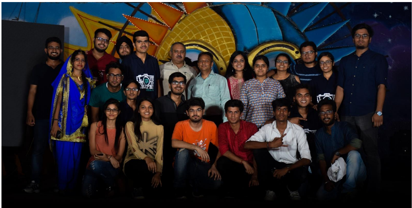
Team Jhalak with Honorable DSW and Registrar